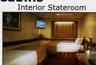
(Category 4A - 4D)

Note: Cabins in categories 4A-8D & 12 have two twin beds that can be combined to form a king-size bed. Some cabins can accommodate third & fourth passengers.