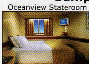
(Category 6A - 6D)